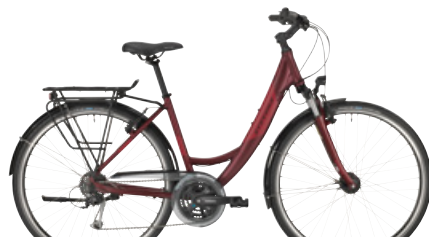
› Forma // Bordeaux