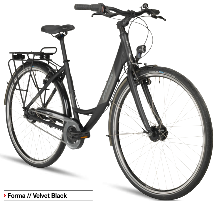
► Forma // Velvet Black