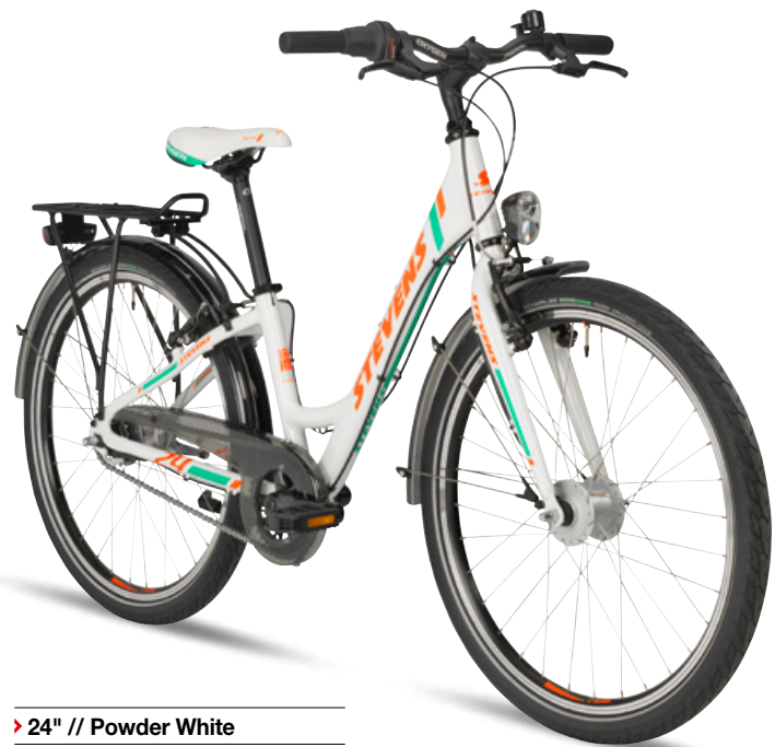
▶ 24" // Powder White