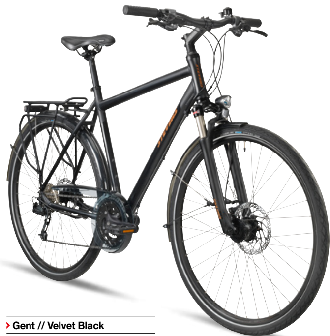
▶ Gent // Velvet Black