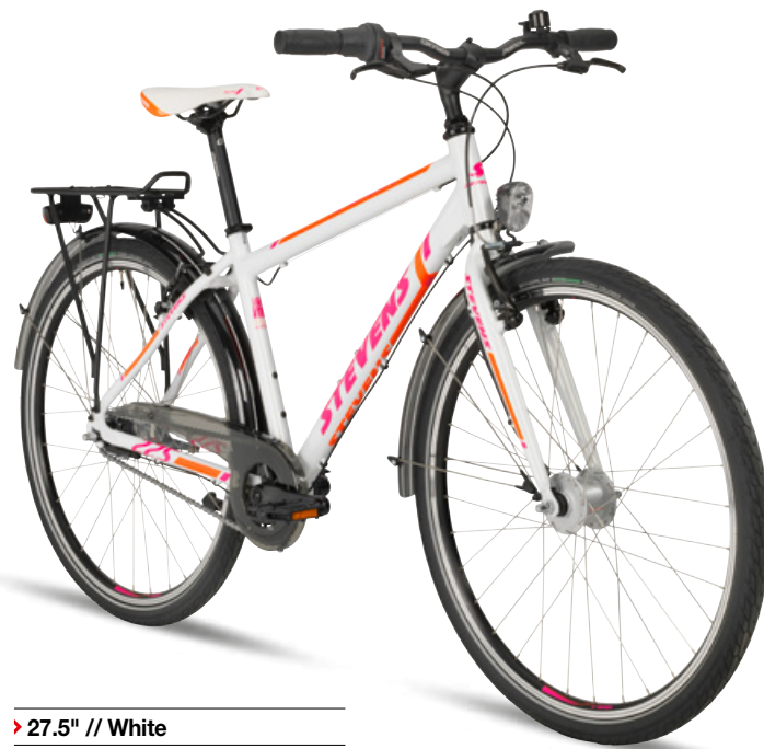
>> 27.5" // White