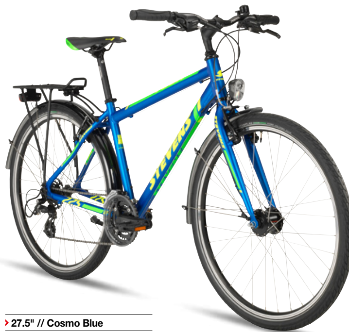
▶ 27.5" // Cosmo Blue