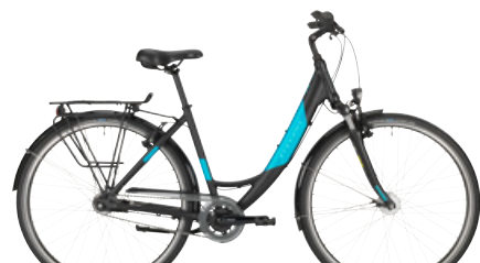
› Forma // Velvet Black