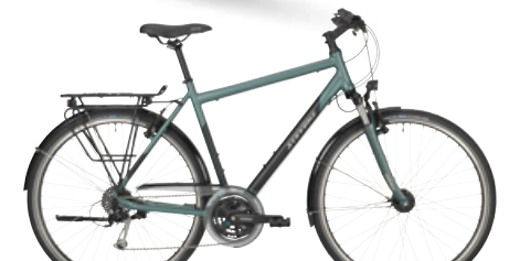
› Gent // Grey Green