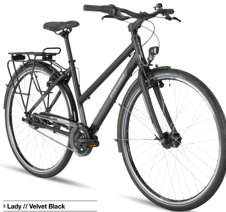
► Lady // Velvet Black