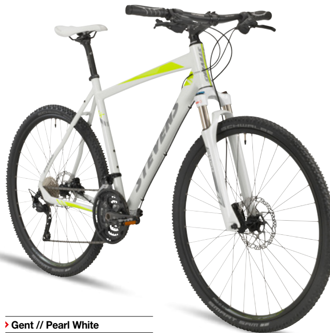
► Gent // Pearl White