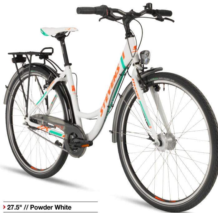
▶ 27.5" // Powder White