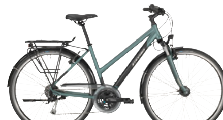
› Lady // Grey Green