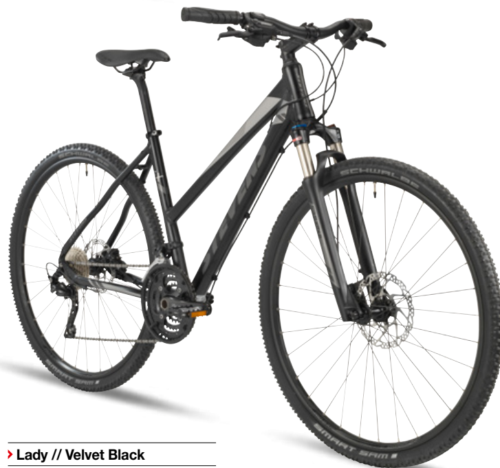
► Lady // Velvet Black