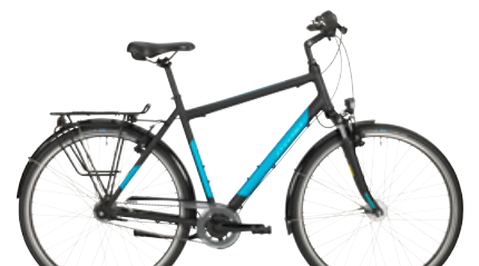
› Gent // Velvet Black