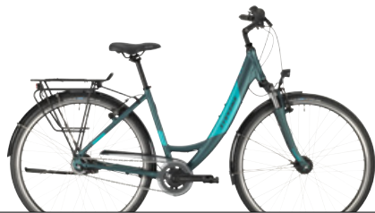
› Forma // Petrol

Fork SR Suntour CR8-V, 50 mm Wheels Shimano Nexus | Oxygen COMP A19 Tires Schwalbe Citizen 42-622 Brakes Tektro STB-01, V-Brake | coasterbrake Derailleurs Shimano Nexus 8-speed w/ coasterbrake Crankset Oxygen Aluminium, 38 T Cockpit Oxygen Pistol 610 mm | Versa, adjustable Saddle | S.post Selle Royal Wave | Oxygen Aluminium Lighting B+M Upp 30 Lux | Toplight 2C+ Accessories STEVENS rear carrier | SKS mudguards | kickstand