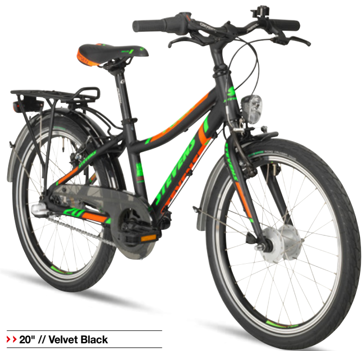
>> 20" // Velvet Black