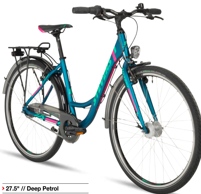
▶ 27.5" // Deep Petrol