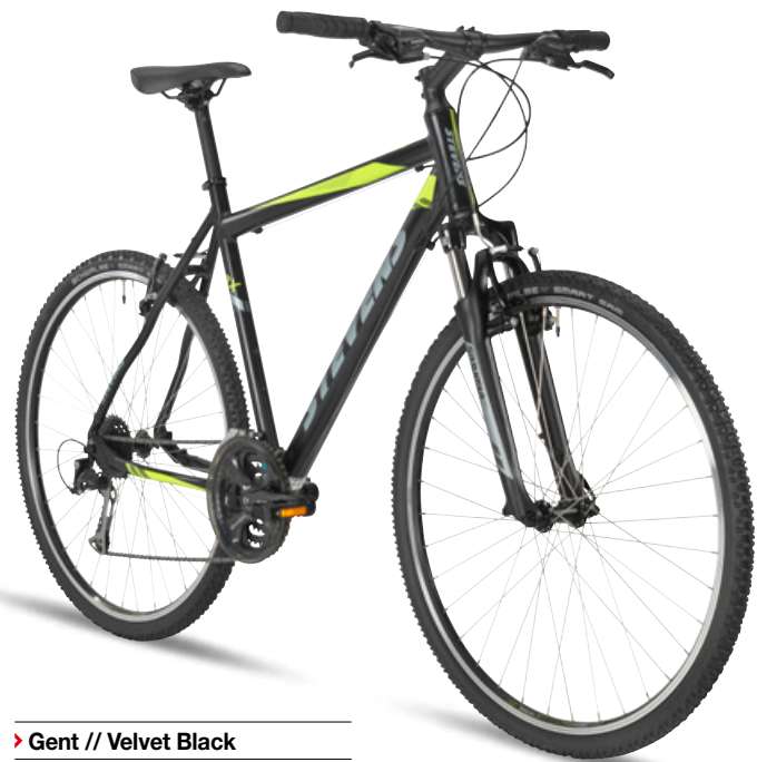
► Gent // Velvet Black