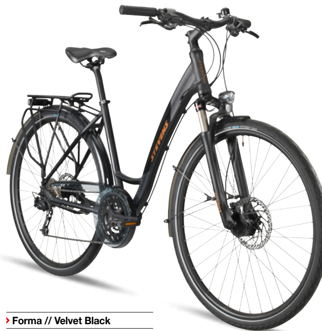
▶ Forma // Velvet Black