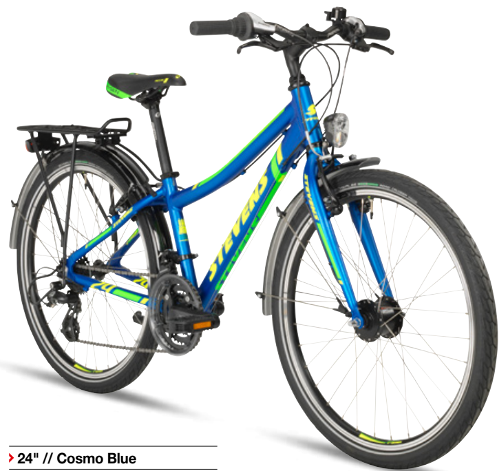
▶ 24" // Cosmo Blue