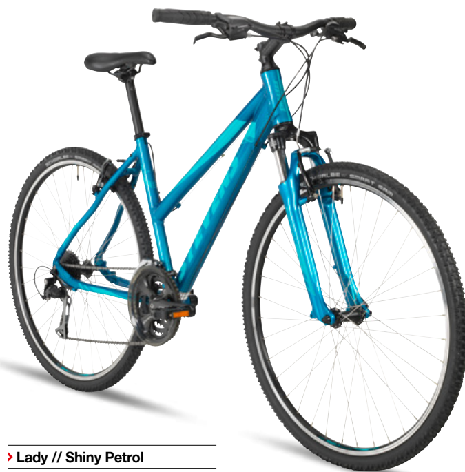
► Lady // Shiny Petrol