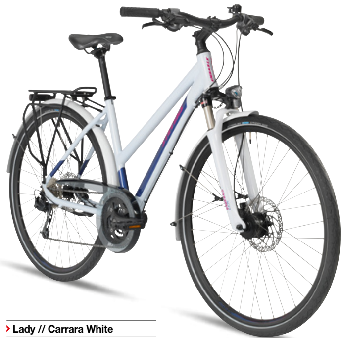
▶ Lady // Carrara White