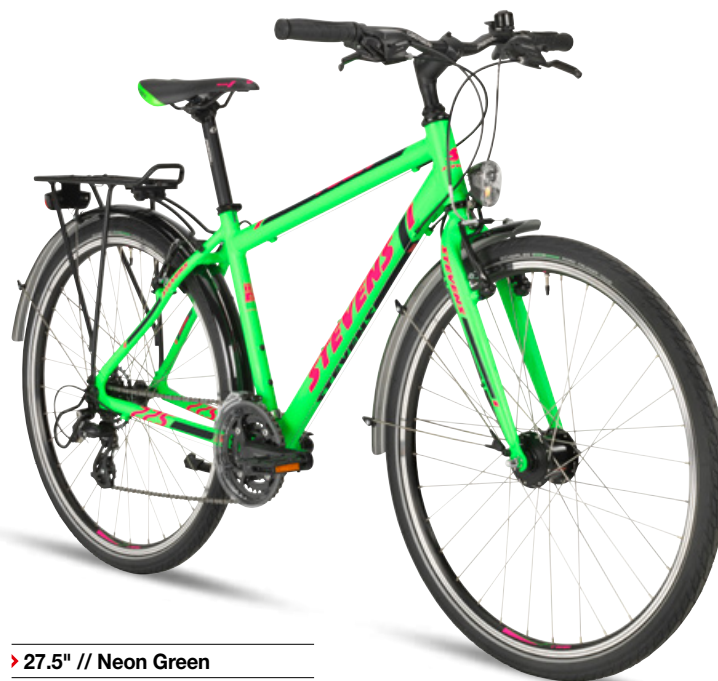
▶ 27.5" // Neon Green