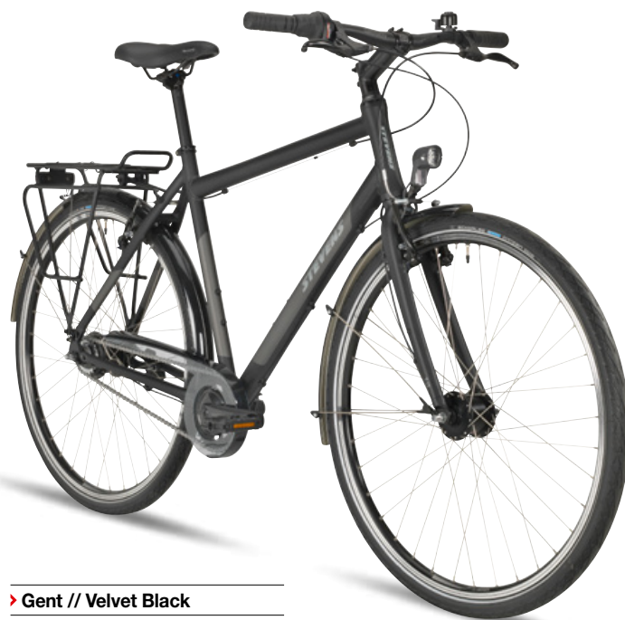
► Gent // Velvet Black