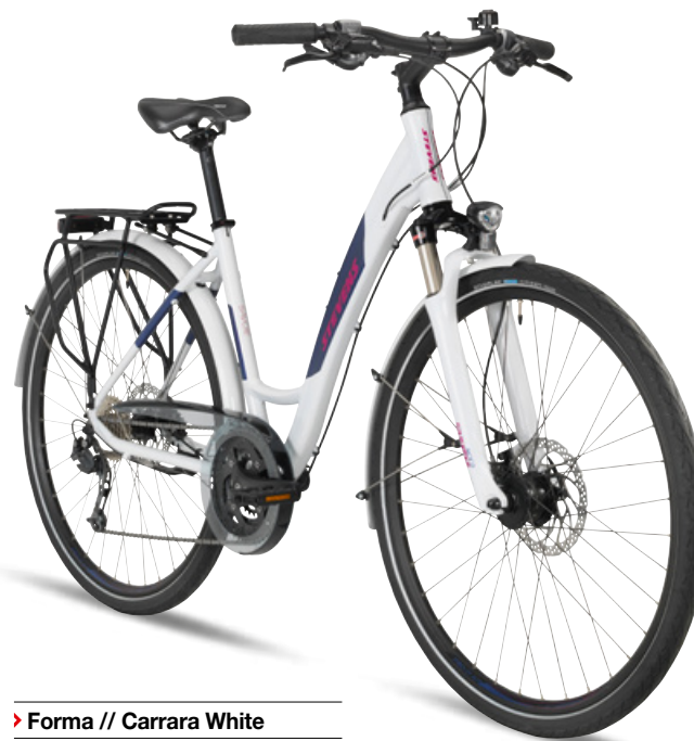
▶ Forma // Carrara White