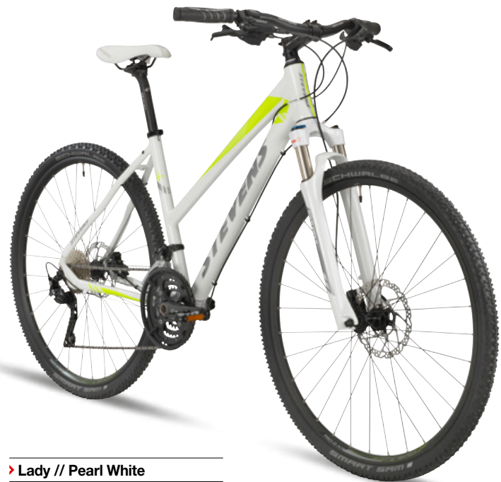
► Lady // Pearl White