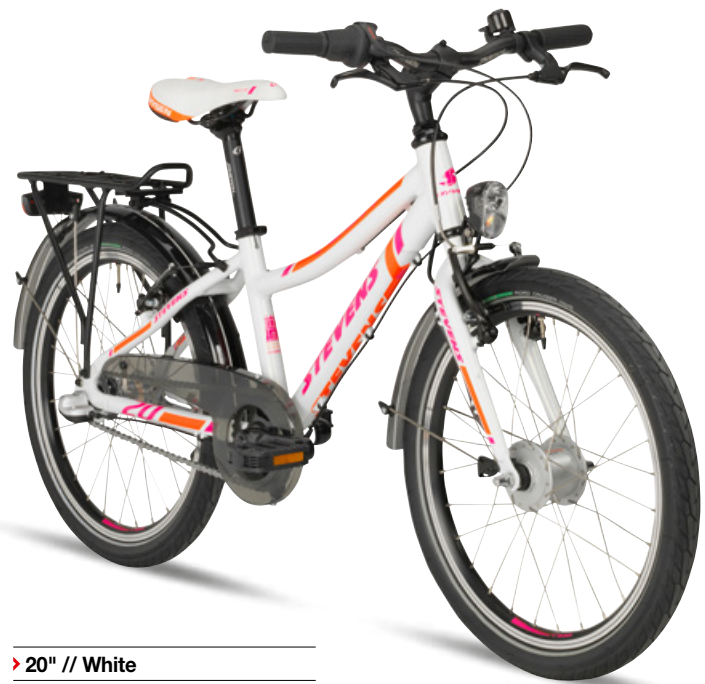
>> 20" // White