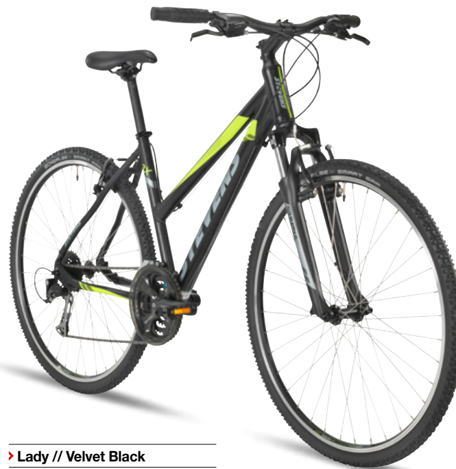
► Lady // Velvet Black