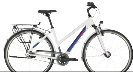
› Lady // Powder White