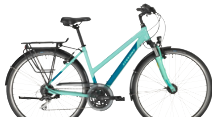
› Lady // Turquoise