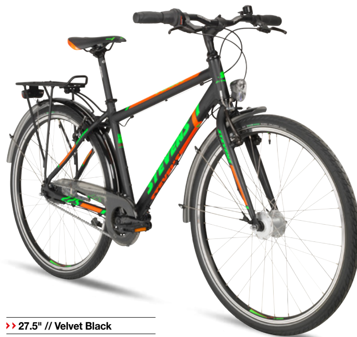
>> 27.5" // Velvet Black