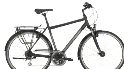
› Gent // Velvet Black