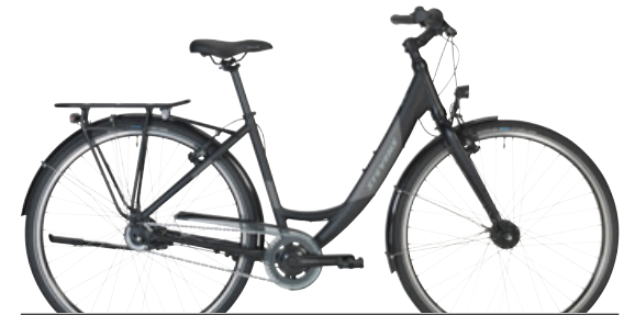
► Forma // Velvet Black