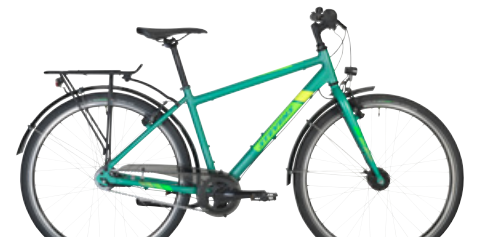
› 27,5" // Lagoon Green