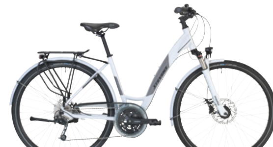
► Forma // Carrara White