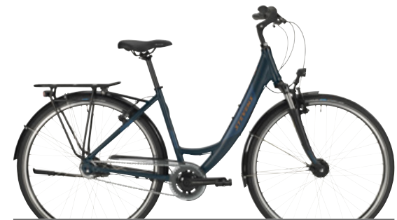
► Forma // Deep Blue