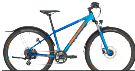
› 27,5" // Deep Sea Blue