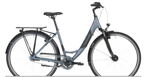
► Forma // Foggy Grey