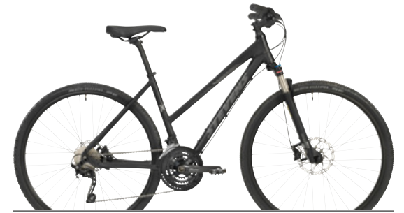
► Lady // Velvet Black