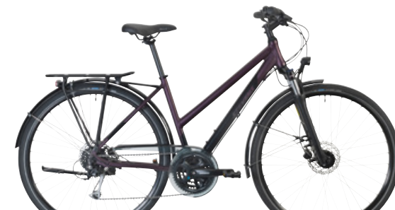
▶ Lady // Mystic Purple