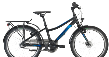
› 20" // Cosmos Black