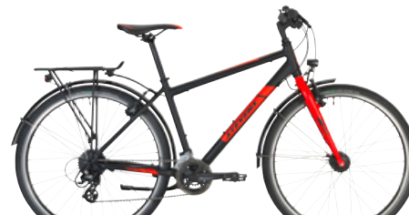
› 27,5" // Velvet Black