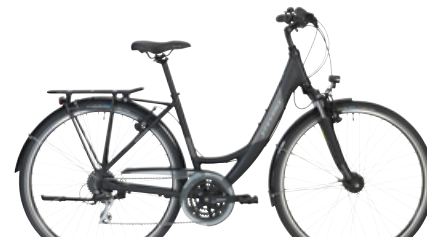
› Forma // Velvet Black