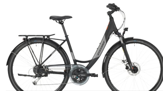
▶ Forma // Velvet Black