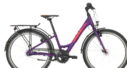
› 24" // Deep Purple