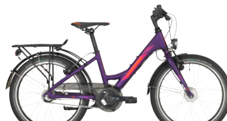
› 20" // Deep Purple