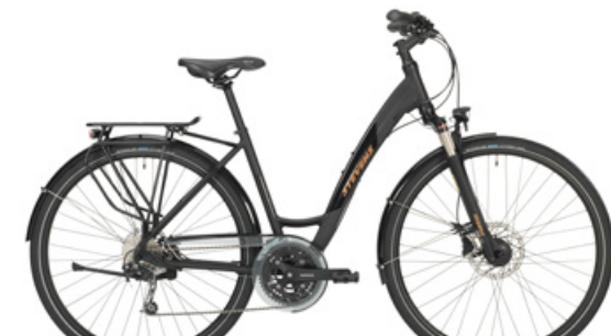
► Forma // Stealth Black