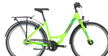
› 27,5" // Flash Green