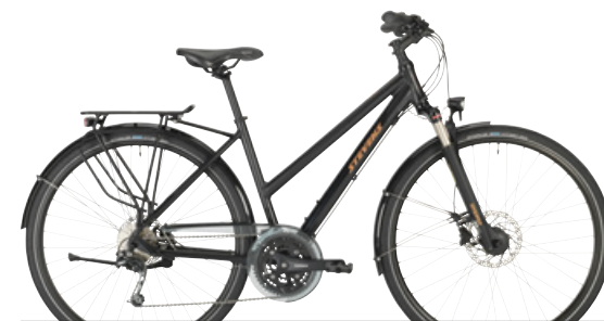
► Lady // Stealth Black