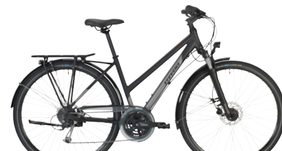
▶ Lady // Velvet Black