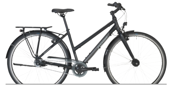
► Lady // Velvet Black