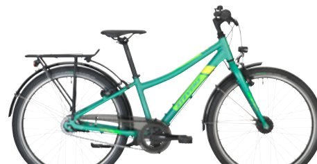
› 24" // Lagoon Green