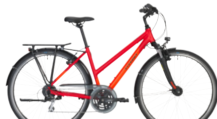
› Lady // Lightning Red