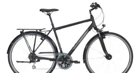
› Gent // Velvet Black