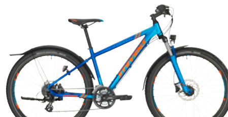
› 27,5" // Deep Sea Blue