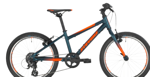
► 20" // Moonlight Blue