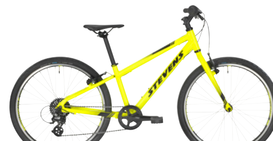
► 24" // Neon Yellow