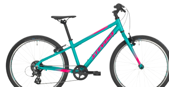
► 24" // Bright Turquoise