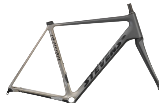
► Slate Grey