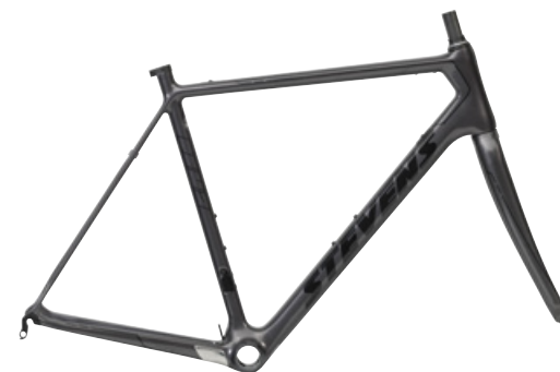
► Phantom Grey