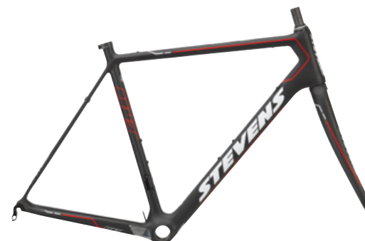
► Ink Black

Custom bike incl. special options. Further details see stevensbikes.de/custom