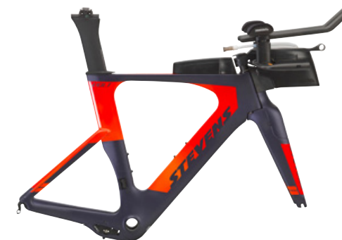
› Deep Violet