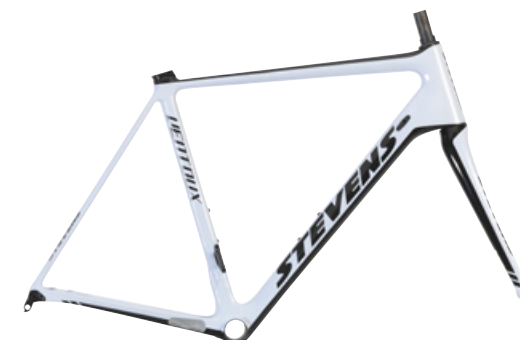
► Carrara White