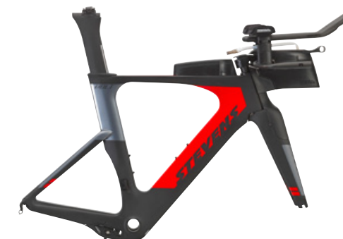
› Carbon Fire-Red

Custom bike incl. special options. Further details see stevensbikes.de/custom